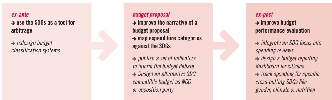
Figure 3. Observed ways to integrate the SDGs into the budgetary process and further ideas

The objective of this study was to give insights into the different uses of the SDGs in budgeting processes and into the potential added value for SDG implementation. This should be put into perspective: first, the implementation of the Agenda 2030 is not just a matter of financial means, and SDG spending reflects only part of the political effort towards the achievement of the SDGs. To be successfully attained, some SDGs need regulatory and legal measures as much as they do financial support, such as Goal 10 (reduced inequalities) and Goal 12 (responsible consumption and production). Secondly, making SDGs visible in the budgeting process does not necessarily mean that more effort and/or money would be made available for the SDGs. Research on the new wealth indicators shows that indicators can be used as tools for steering public action if they are used at all stages of public policy making, both upstream to legitimize and institutionalize a phenomenon and to monitor its evolution, and also downstream to evaluate the results of a policy strategy (Demailly et al. , 2015). In other words, they have to be used in the broad political debate, and not only at the budgetary debate stage. ■